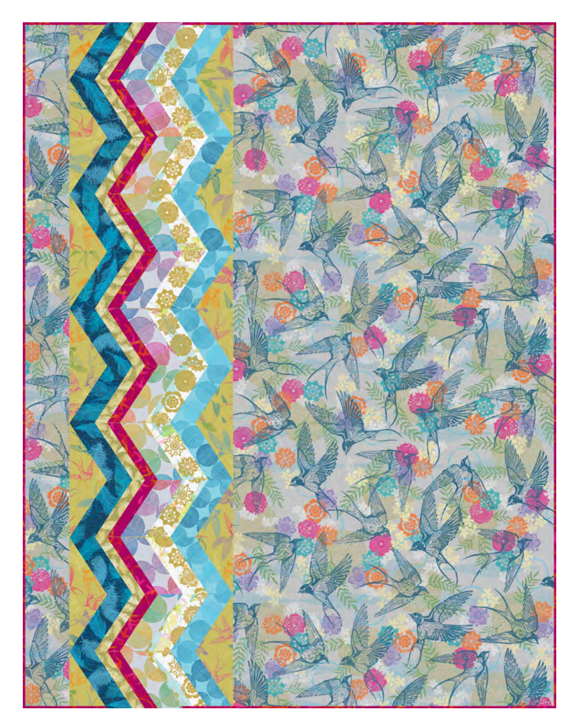
Featuring Findings by Valori Wells