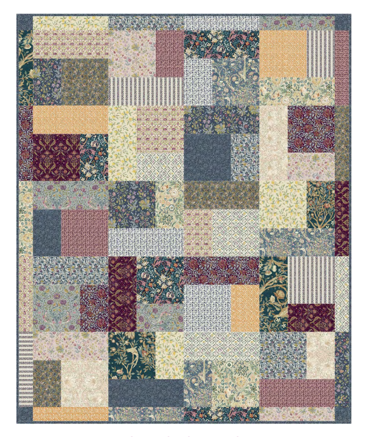
Featuring Red House by The Original Morris & Co.